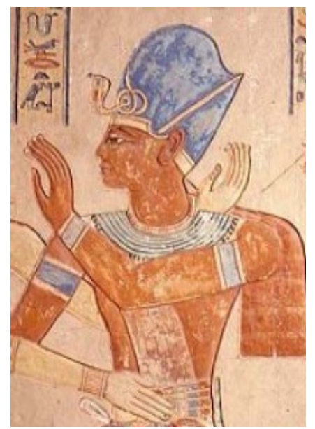
Artists impression of Phil-Ankh-Amon

By ancient tradition, the leaders of the Hyperborean tribes gather once every twenty-five earth cycles at the ancient pyramids of Dutret to pay homage to the Great God Ra-Amon-Thotep.