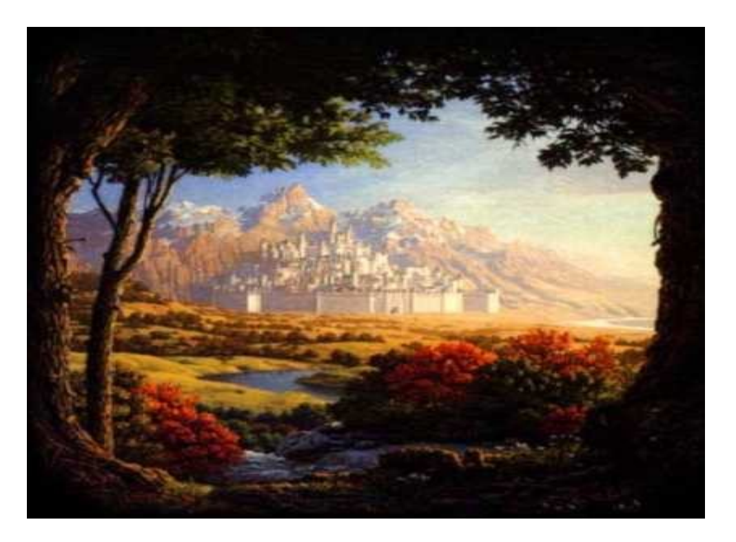
The legendary City of Oeta, an Oasis of civilisation in the North