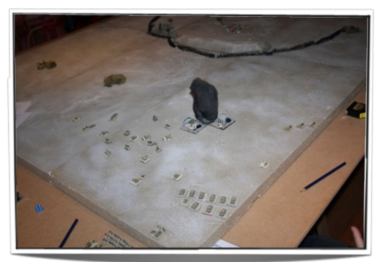
Fig. 1 A few outlying buildings burn after a British artillery shoot. This is an actual in game photo from our game with this scenario.

Finally, although the OOBs do not mention this, both sides have enough trucks to transport every unit.